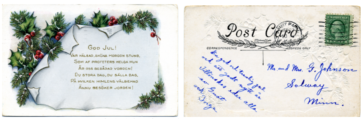
Figure 69. God Jul! from Gust and Inga Larson; postmark, 22 Dec 1920.